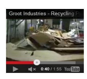
Virtual Tour Tour Recycling Sites